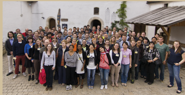
Successful consortia are the reward for our activities

Building the bridge from bench to bedside